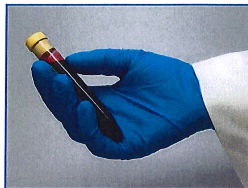
A vial of blood.

According to U.S. HIV treatment guidelines, viral load typically should be measured every three to four months. People living with HIV should talk with their health care teams to determine an appropriate schedule for viral load testing.